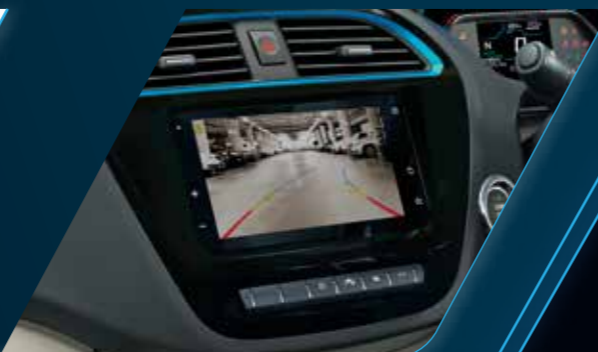
REAR-PARK ASSIST WITH CAMERA (WITH DYNAMIC GUIDEWAYS)