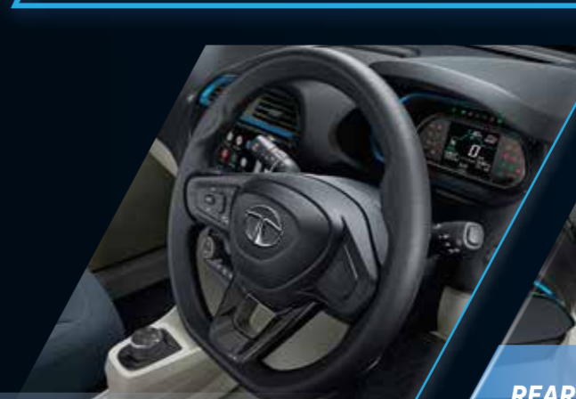
FLAT BOTTOM STEERING WHEEL for added comfort while you enjoy an electric drive