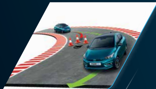
ABS WITH EBD AND CORNER STABILITY CONTROL