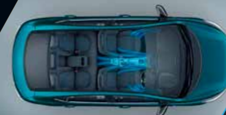
FULLY AUTOMATIC TEMPERATURE CONTROL for that chilled out drive experience (standard across variants)