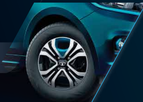
HYPER-STYLE WHEELS for the hyper cool you with an added touch of electric highlights