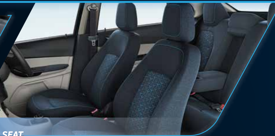
REAR SEAT designed with a foldable armrest and cup holders