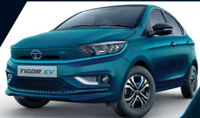
CONTEMPORARY STYLE to make you the trendsetter wherever you go