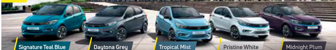
Signature Teal Blue